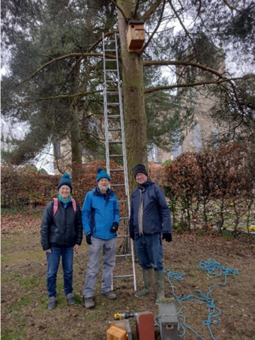
Volunteers ready for a tea break

It will be owl right on the night – good news for owls