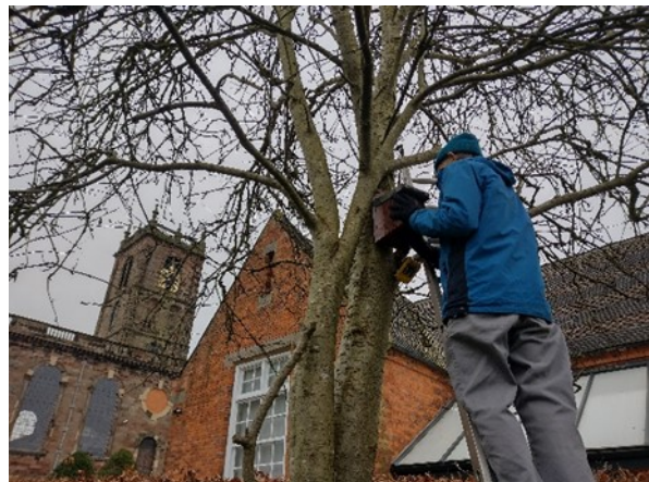
Another box being installed