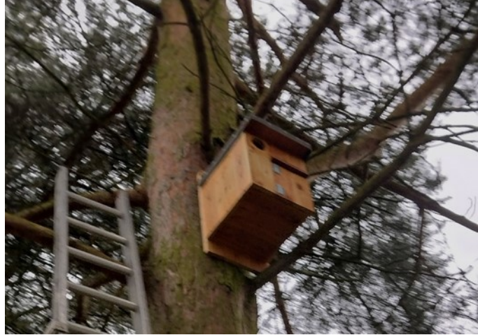
A new home for an owl