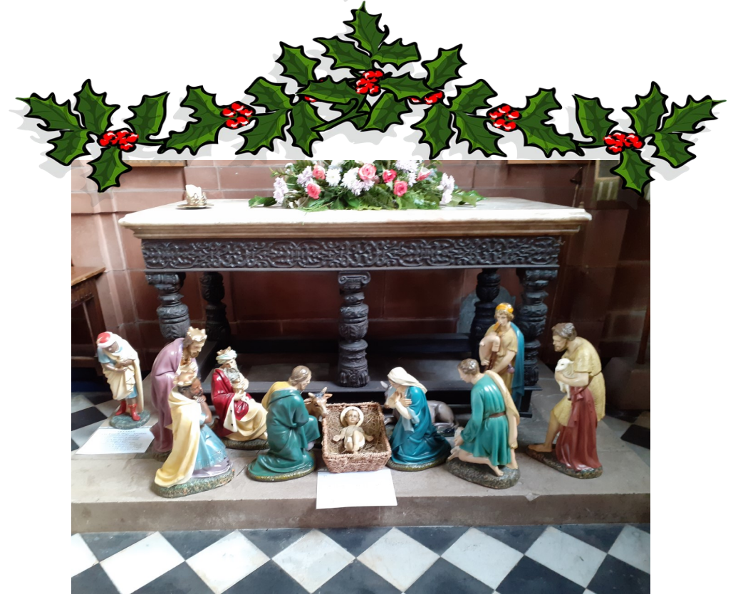
The beautiful nativity figures from St George's RC Church on display at the Crib Festival