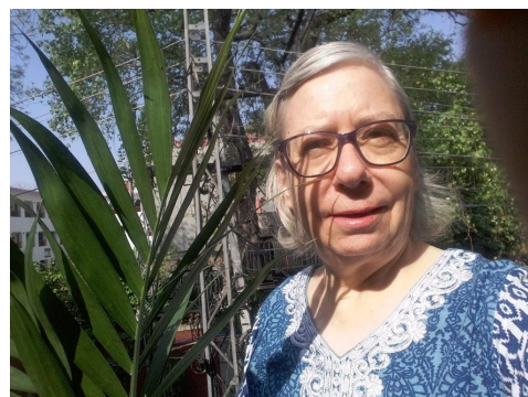
Palm Sunday in lock down