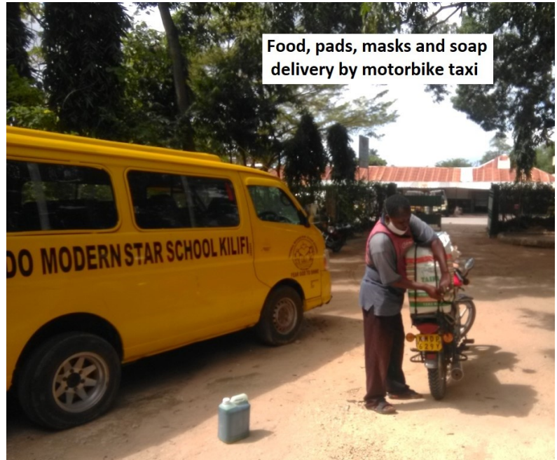
Food, pads, masks and soap delivery by motorbike taxi

“Habari za shughuli?” “Corona” (How are things? Corona) That’s the greeting and reply I heard in the market last week. Kenya has 490 confirmed cases at the last count, but only 24,784 people have been tested up to May 4th. Kilifi County was one of the first to report cases after a politician returned with the infection from Germany, continued with public duties then refused to go into quarantine. Since then confirmed cases in our county have remained at 9 or 10 according to which newspaper you read. The neighbouring county Mombasa has the most reported new cases this month. A mass testing there last week has not been successful as few took up the opportunity. Why? Well, people testing positive have to go into government quarantine facilities and pay approximately £200 for their 14 days stay. Reportedly the accommodation and food aren’t brilliant and people have to share bathrooms.