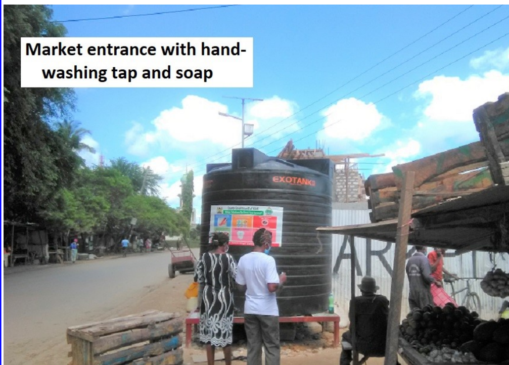
Market entrance with hand-washing tap and soap

We are being advised to stay home and some businesses are shut. There’s a night curfew and no movement allowed in or out of 5 counties including Kilifi and Mombasa.) Those caught trying to get out of Nairobi were also put in quarantine regardless of their Covid-19 status.