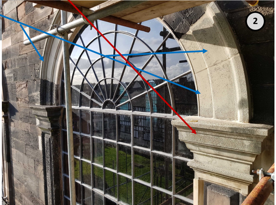
Below 2: Stones in place

Below left 3: shows an old iron fixture where a damaged stone has been removed—these were used to tie the stones together—seems like a good idea unfortunately when the iron rusts it expands and cracks the stone then water penetrates which causes more damage especially when it expands upon freezing.