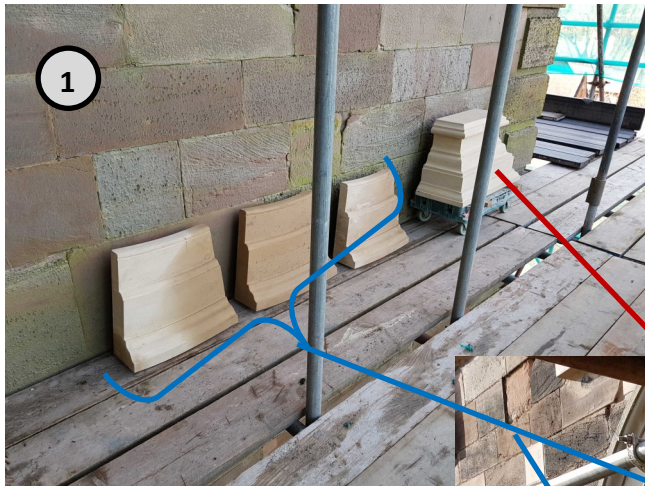
Left– 1: Carved stone ready to be installed