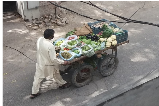
Sabziwala passing below my balcony

I am fortunate to live where I do with two small general stores within 2 minutes walk, for basic commodities, and fresh fruit and vegetables available as the sabziwalas and fruitwalas come every day with their barrows. The weather is pleasant because we have had rain from time to time, which has delayed the onset of summer. On Saturday (25 th April), the Muslim fasting month of Ramadan began. The breaking of the fast is normally celebrated by iftar parties in the evening, which have officially been banned because of the lock down, so we shall see what happens.