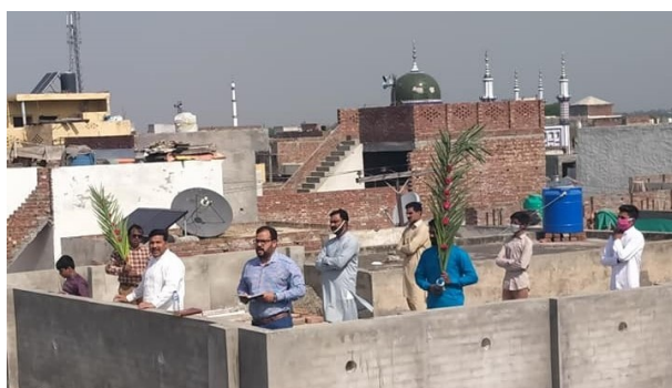
Palm Sunday service on the roof tops