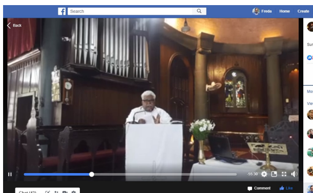
Live transmission from St. Andrew's Church