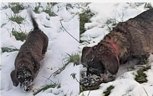
Dachshunds in the snow